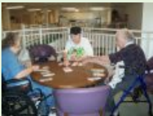
Canasta, Skip Bo, Pinochle Groups

If you would like to learn or join, please come by the library on Tuesday and Thursday at 10:30 a.m.